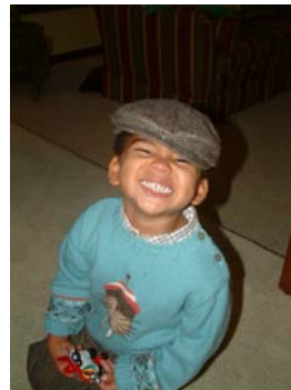
A proud demonstration of one healthy mouth!

We are kicking off our Cavity-Free Club announcement with his picture, since he's had no cavities during his last two visits. Hint: You have all met his dad at your last visit!